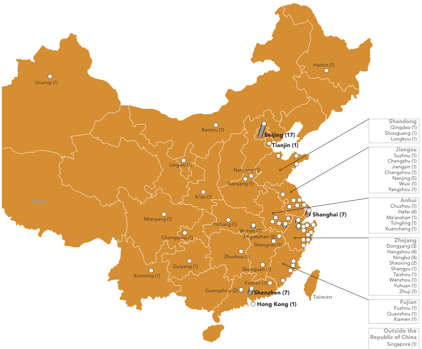
Figure 2: Headquarter locations of China's next 100 global giants