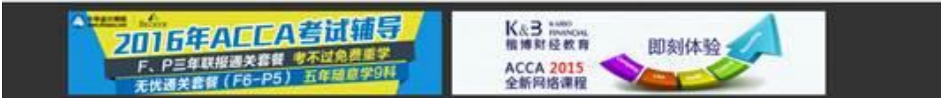
Homepage Bottom banner